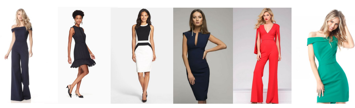
Show Opener: MISS contestants must have a cocktail dress in black TEEN contestants must have a cocktail dress in white

Private Interview : An outfit that represents your personality and you feel comfortable wearing. This can range from casual to business oriented, but something you would find in your own closet. You will wear this during your onsite interview.